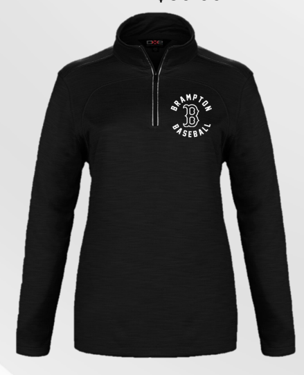
Also available in Black